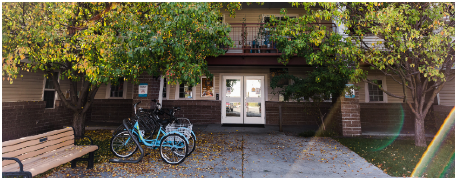
Bikes parked outside the Missoula Housing Authority building