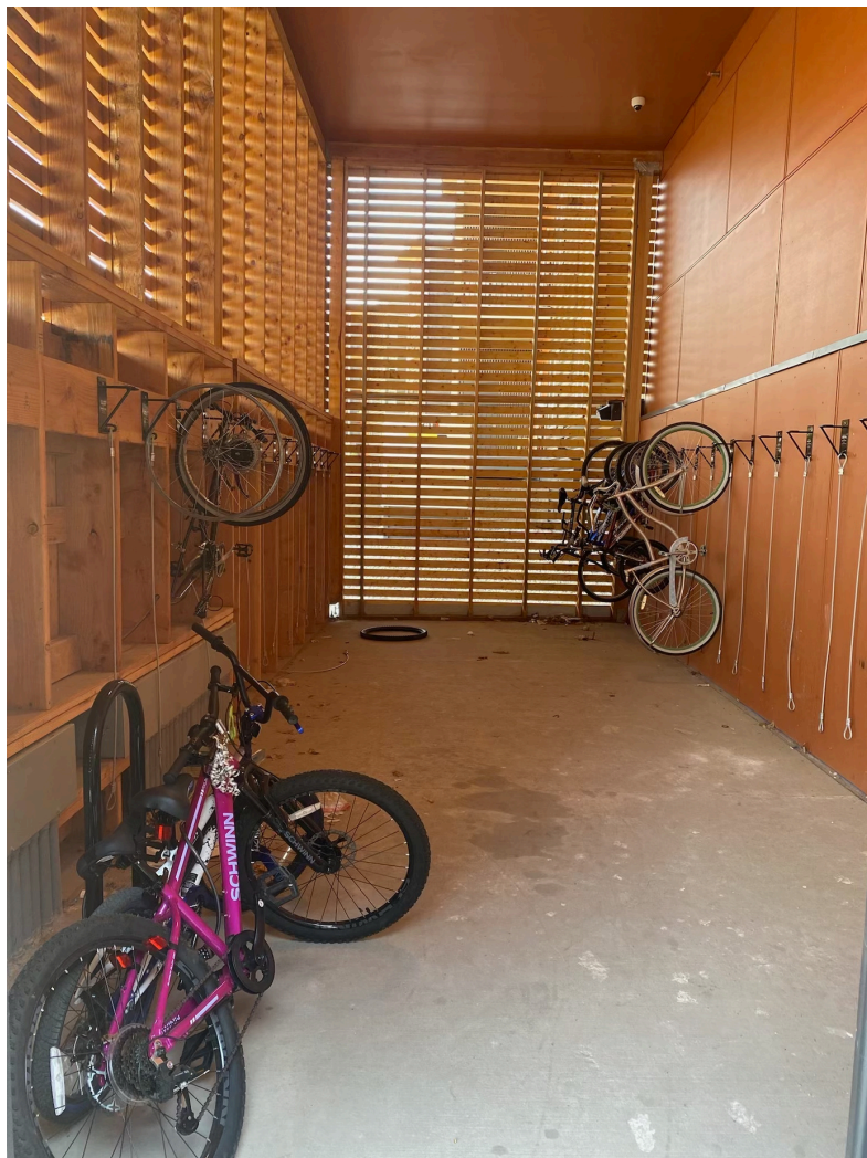
Bikes in the covered bike locker at the Villagio.