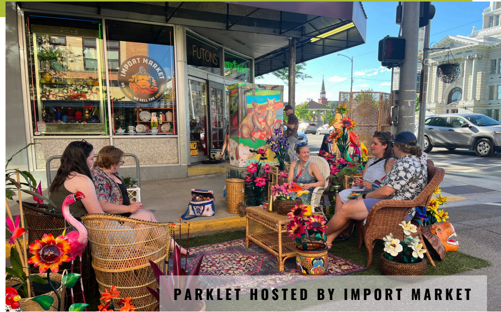
PARKLET HOSTED BY IMPORT MARKET

First Friday Parklets transform parking spaces into people places for the day in support of a friendly environment for biking and walking.